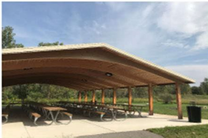
Lighting, Power & Trash Cans