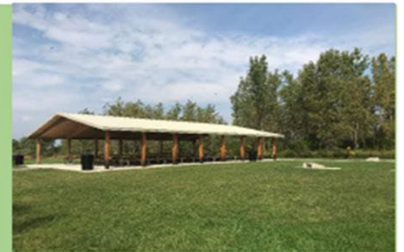
Grass Area with 2 Bean Bag Games